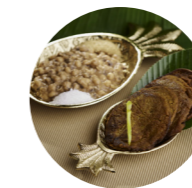
Tatale and Aboboi Ghc 160 Ripe plantain pancakes served with bambara beans, brown sugar or white sugar