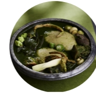
Fufu and Abunuabunu Ghc 210.00 Plantain or cocoyam mixed with cassava fufu served with green (kontomire) soup with dryfish, snail, grasscutter, mushrooms, sliced okro and garden eggs