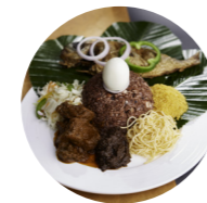
Azmera Waakye Ghc 170 Rice and beans served with fish, eggs, beef, gari, spaghetti, wele, shito & tomato stew