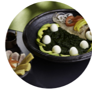
Ampesi and Asanka Kontomire Ghc 170 Boiled yam, plantain, ripe plantain and cocoyam served with mashed kontomire, koobi, boiled eggs, palm oil and sliced avocado (seasonal)