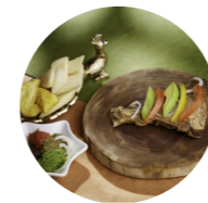
Azmera Fried Yam / Sweet Potato Ghc170 Fried yam/sweet potatoes, served with sardines, fried fish, grilled tilapia or grilled chicken or pork with red or green pepper & shito