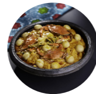
Mpotompotor Ghc 160 Cocoyam cooked in palmmust sauce served with salted beef, dryfish & crabs