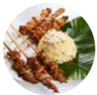
Azmera Fried Rice Ghc 170 Fried Rice with your choice of any grill served with coleslaw, shito & green pepper