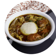
Banku and Okro Stew Ghc 170 Corn or millet banku served with okro stew, crabs, tuna, salmon, wele & salted beef.