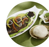
Banku and Tilapia Ghc 170 Corn or millet banku served with spicy, grilled tilapia, vegetables & avocados (seasonal)