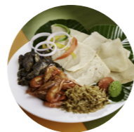
Aboloo with UN Fish Ghc 160 Served with baby tilapia & keta schoolboys served with hot pepper