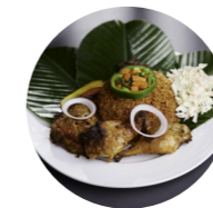
Azmera Ghana Jollof Ghc 170 Jollof rice served with grilled/fried chicken/pork or fried fish/ grilled tilapia with a side of shito & green pepper