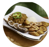
Red Red Ghc 170 Fried ripe plantains with beans stew served with gari & fish or chicken