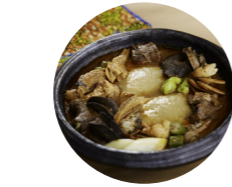
Fufu and United Nations Soup Ghc 210 Assorted meat and fish