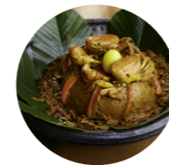
Apapransa Ghc 160 Roasted corn powder cooked with palmmust soup served with beans, crabs & dryfish