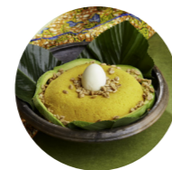
Etor Ghc 170 Mashed plantain or yam served with salted fish, eggs, avocado (seasonal), roasted peanuts & palm oil