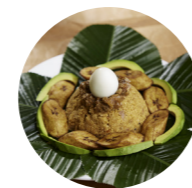
Gari Fotor Ghc 160 Gari mixed in tomato stew, served with beans, sardines, fried plantains & avocados (seasonal)