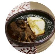
TZ and Ayoyo Soup Ghc 190 Served with beef & intestine stew